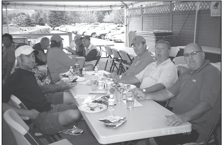
Members of the third-place South Beacon Hill Hackers, after their round of golf at the CHSAA Golf Scramble.

Once again, the scramble format was used. A new twist this year was using a "licorice rope" on the greens. The team was allowed to use the length or a portion of the licorice rope to save a putting stroke on an individual hole. This innovation made every team competitive, added another strategy to the game, was lots of fun and was a tasty snack. The caveat was you could buy extra ropes to enhance your chances of victory.